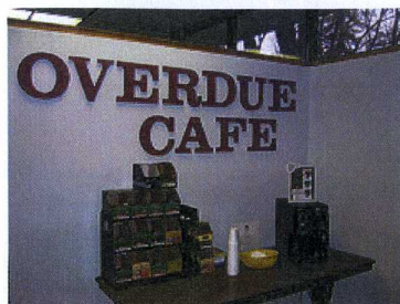
Coffee & Books!

Children's & Young Adult services remain a key focus, as we work to open the wonderful world of reading to our youth. Reading remains our core service. I encourage you to take advantage of our excellent collection - everyone should always have a good book close at hand! - Ed Dunscombe