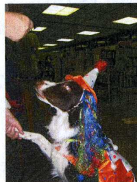
B.A.R.K.-9 therapy dogs in costume for Halloween