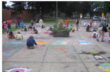
Chalk Art Extravaganza