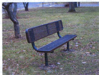
New Benches on the lawn of the library.