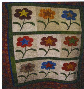
2006 Raffle Quilt donated by Carol Bunnell

Fortunately our library was not directly impacted by either of the 2006 floods. In response to the state of emergency the library closed June 28 and June 29, and reopened June 30. Floodwaters did not seriously threaten our building, and there was no seepage of water into the basement. The library waived fines on approximately $100.00 in materials damaged in patron's homes due to the June floods. Several area libraries suffered expensive damage, notably those in Walton and Sidney. Several library staff also had damage to their homes in both incidents, but the library work schedule was not effected. I attended a workshop on library disaster recovery and learned that Cornell University offers free use of their "book freezer" to freeze water-damaged books so that they can be treated before mold develops and destroys them. Damage from leaking roofs and pipes is a much more likely problem for libraries than damage from floods.—Ed Dunscombe, Director