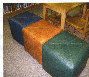
New library furniture

George F. Johnson Memorial Library 1001 Park St. Endicott, NY 13760