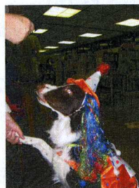
B.A.R.K.-9 therapy dogs in costume for Halloween