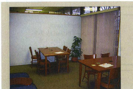
The Laptop Lounge