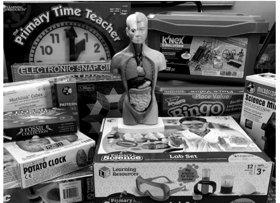
A few of the items in the Discovery Collection available for check-out.

The pass is available at the circulation desk and can be checked out for one week.